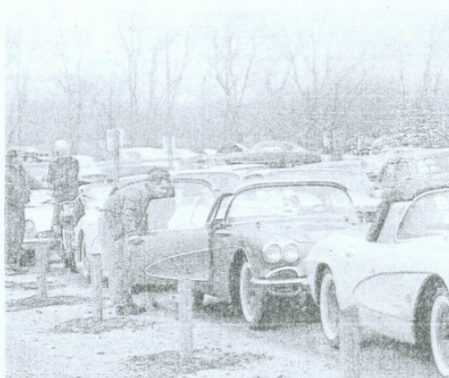
WAITING TO GO, hit the traps at Alton Ill. Drag Strip are just a few of the cars that showed up.