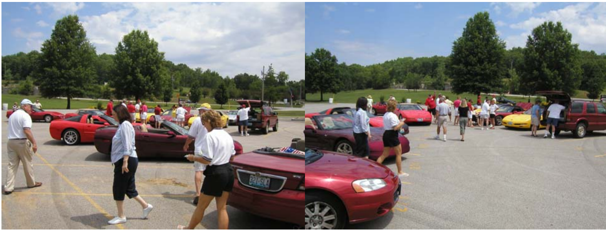
FIRST ST. LOUIS CORVETTE CLUB FUN RALLY = SUCCESS/FUN