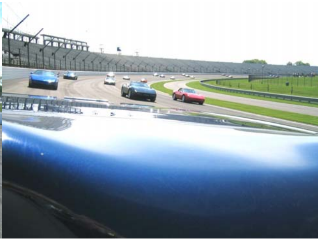
INDY CRUISING—THOSE THAT WERE ABLE TO ATTEND HAD A GREAT DAY— PICTURE'S DON'T DO IT JUSTICE