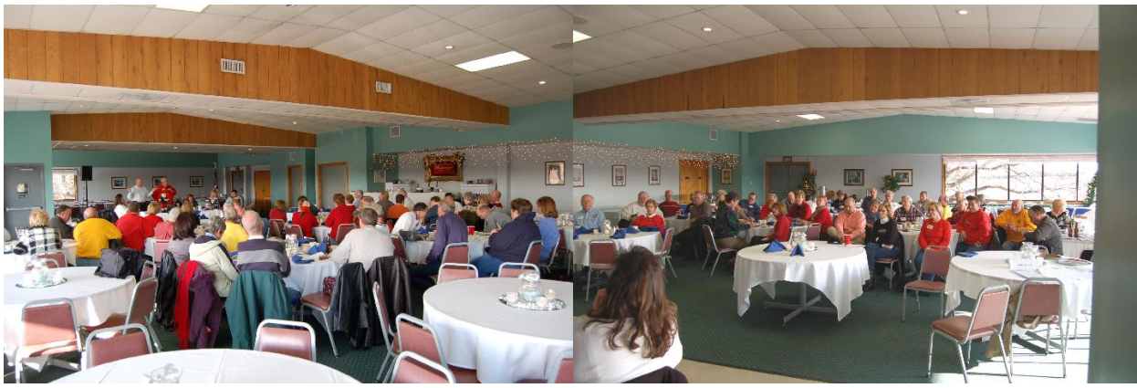
A COUPLE OF PICTURES FROM OUR NEW MEETING ROOM.

Monthly Meetings are held at Sunset Hills Banquet Center. "Corvette safe" parking on the West lot. 6:00 Open Bar, 6:30 Buffet Dinner, 7:00.